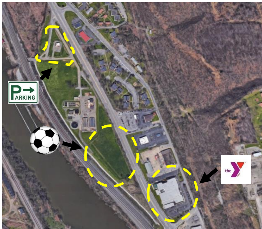
Figure 3: Aerial View of field, parking area and Beaver County YMCA.