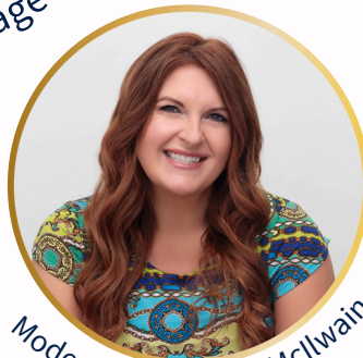
Moderated by Holly McIlwain